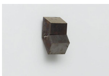
Untitled (Fist Series), 2014 Steel 7 x 4 x 4 inches (17.8 x 10.2 x 10.2 cm) NON-0065