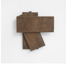
Untitled, 2006 Steel 12 1/2 x 11 3/4 x 1 3/4 inches (31.8 x 29.8 x 4.4 cm) NON-0244