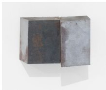
Untitled (Fist Series) , 2014 Steel 4 x 6 1/4 x 6 inches (10.2 x 15.9 x 15.2 cm) NON-0059