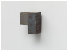
Untitled (Fist Series) , 2014 Steel 7 1/4 x 6 x 4 1/4 inches (18.4 x 15.2 x 10.8 cm) NON-0071