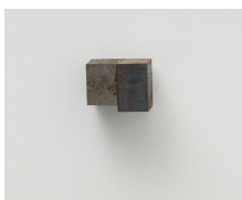
Untitled (Fist Series), 2014 Steel 5 x 6 x 4 1/4 inches (12.7 x 15.2 x 10.8 cm) NON-0061