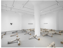
Riven , 1991/2017 Birch logs 92 parts; installation variable NON-0235