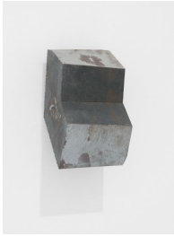
Untitled (Fist Series), 2014 Steel 7 x 4 x 4 inches (17.8 x 10.2 x 10.2 cm) NON-0060