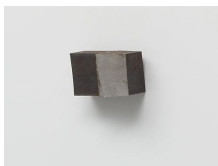
Untitled (Fist Series) , 2014 Steel 4 x 6 1/4 x 4 inches (10.2 x 15.9 x 10.2 cm) NON-0070