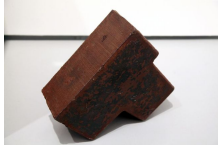
Here Now , 1985 Steel 10 x 12 x 4 1/8 inches (25.4 x 30.5 x 10.5 cm) NON-0086