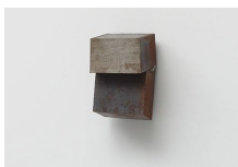
Untitled (Fist Series) , 2014 Steel 6 x 4 x 4 inches (15.2 x 10.2 x 10.2 cm) NON-0072