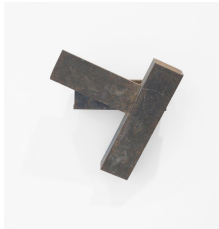
Untitled , c. 1980s Steel 16 1/2 x 16 x 7 5/8 inches (41.9 x 40.6 x 19.4 cm) NON-0241