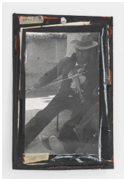
Untitled, 1985 Photograph 10 1/4 x 6 3/4 inches (26 x 17.1 cm) NON-0253