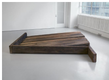
Southern Champ (for Robert Prado) , 1973 Wood 16 x 115 1/2 x 112 inches (40.6 x 293.4 x 284.5 cm) NON-0236