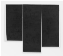
Untitled , 2017 Oil paint on paper Overall: 94 x 111 inches (238.8 x 281.9 cm) NON-0242