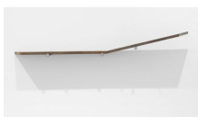
Untitled, 1986 Steel 5 x 36 1/2 x 4 1/2 inches (12.7 x 92.7 x 11.4 cm) NON-0247