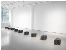
Rasp , 2017 Steel 9 parts, each: 12 x 20 x 12 inches (30.5 x 50.8 x 30.5 cm) NON-0243