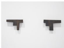
Untitled , 1987 Steel 2 parts, each: 14 x 23 x 3 1/2 inches (35.6 x 58.4 x 8.9 cm) NON-0240