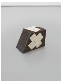
Untitled, 1986 Oil paint on steel 9 1/4 x 8 3/4 x 6 3/4 inches (23.5 x 22.2 x 17.1 cm) NON-0006