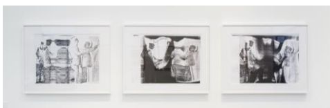
Sieht man ja was es ist , 1995 3 manipulated photocopies Each: 16 1/2 x 23 inches / 41.9 x 58.4 cm POL-0036