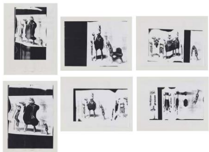
Untitled , 1997 6 manipulated photocopies Each: 23 x 16 1/2 inches / 58.4 x 41.9 cm POL-0063 through POL-0068