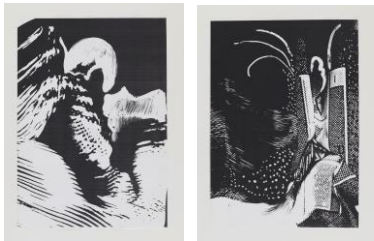
Untitled , ca. 2005 2 manipulated photocopies Each: 16 1/2 x 23 inches / 41.9 x 58.4 cm POL-0031 / POL-0029