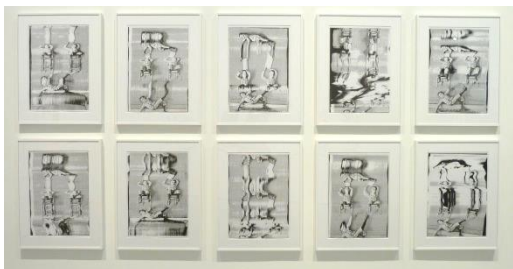
Untitled , 2000 10 manipulated photocopies Each: 23 x 16 1/2 inches / 58.4 x 41.9 cm POL-0077 through POL-0086