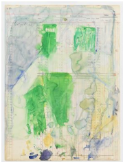
Paros (from the series 'Cyclades'), 1995 Watercolor on antique ledger paper 24 x 17 3/4 inches (61.2 x 45.1 cm) Framed: 30 3/4 x 24 inches (78.1 x 61 cm) JUN-0033