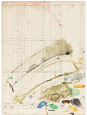
Paros (from the series 'Cyclades'), 1995 Watercolor on antique ledger paper 24 1/8 x 18 inches (61.4 x 45.5 cm) Framed: 30 5/8 x 24 inches (77.8 x 61 cm) JUN-0032