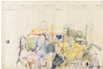
Paros (from the series 'Cyclades'), 1995 Watercolor on antique ledger paper 24 1/8 x 35 3/4 inches (61.3 x 91 cm) Framed: 30 3/4 x 42 inches (78.1 x 107 cm) JUN-0039