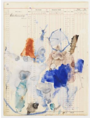
Paros (from the series 'Cyclades'), 1995 Watercolor on antique ledger paper 24 1/8 x 18 inches (61.3 x 45.6 cm) Framed: 30 3/4 x 24 inches (78.1 x 61 cm) JUN-0030