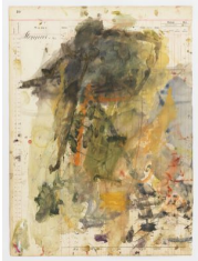
Naxos (from the series 'Cyclades'), 1995 Watercolor on antique ledger paper 24 x 18 inches (61.2 x 45.5 cm) Framed: 30 3/4 x 24 inches (78.1 x 61 cm) JUN-0031