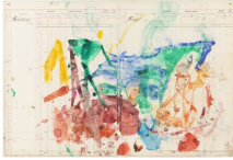
Paros (from the series 'Cyclades'), 1995 Watercolor on antique ledger paper 24 1/8 x 36 inches (61.3 x 91.3 cm) Framed: 30 7/8 x 42 inches (78.4 x 107 cm) JUN-0037