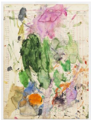
Naxos (from the series 'Cyclades'), 1995 Watercolor on antique ledger paper 24 1/8 x 18 inches (61.3 x 45.5 cm) Framed: 30 3/4 x 24 inches (78.1 x 61 cm) JUN-0035