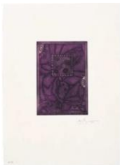
Untitled, 1995 Mezzotint in two colors with chine colle 26 x 19 inches (66 x 48.3 cm) JOHN-0006