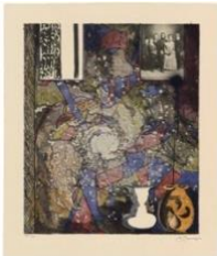
Untitled (American Center), 1994 Lithograph in 8 colors on custom made Japan paper 36 1/4 x 30 1/2 inches (92.1 x 77.5 cm) JOHN-0028