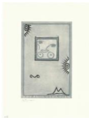
Untitled, 1995 Mezzotint 29 3/4 x 22 1/2 inches (75.6 x 57.2 cm) JOHN-0025