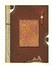
Face with Watch, 1996 Intaglio in five colors 42 x 31 7/8 inches (106.7 x 81 cm) JOHN-0009