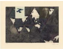
Green Angel 2, 1997 Intaglio 48 x 24 7/8 inches (121.9 x 63.2 cm) JOHN-0027