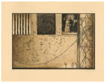
Untitled, 2001 Intaglio 25 7/8 x 33 5/8 inches (65.7 x 85.4 cm) JOHN-0031