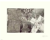
Untitled, 1997 Intaglio in one color 20 x 25 3/4 inches (50.8 x 65.4 cm) JOHN-0008