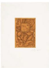
Untitled, 1995 Mezzotint in two colors with chine colle Untitled, 1995 (66 x 48.3 cm) JOHN-0007