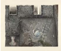
Untitled, 1992 Intaglio 42 1/2 x 52 1/2 inches (108 x 133.4 cm) JOHN-0030