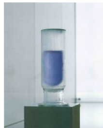
Time Arrow: Oxygen - 183 Degrees C, 1993 3 dewar flasks with liquid oxygen Each: 19 3/4 x diam. 8 1/4 inches / 50.2 x diam. 21 cm Edition of 3 NOM-0024