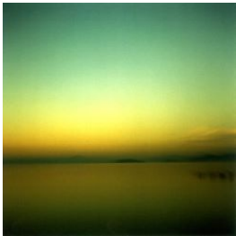
The Earth Rotation, November 8, 1979, 16:39-16:59, 1979 Color photograph 35 1/2 x 35 1/2 inches / 90.17 x 90.17 cm Edition of 5 NOM-0016