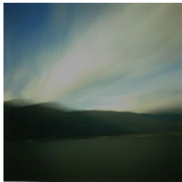
The Earth Rotation, November 19, 1979, 14:16-14:46, 1979 Color photograph 35 1/2 x 35 1/2 inches / 90.17 x 90.17 cm Edition of 5 NOM-0013