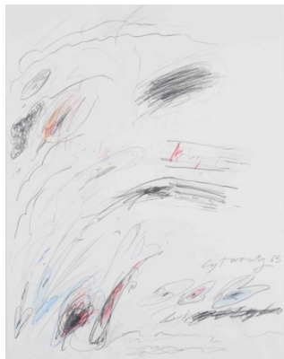
Cy Twombly, Untitled , 1963

Fergus McCaffrey Tokyo is delighted to announce the opening of Seeing without a Seer , a drawing exhibition by eight artists.