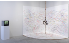
Up to and Including Her Limits , 1975-2008 Crayon on paper, rope, harness, video (color, sound; 29 min.) Dimensions variable SCHN-0001