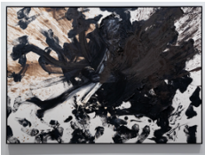
Hiruko , 1992 Oil on canvas 71 1/2 x 102 inches (181.6 x 259.1 cm) SHI-0087