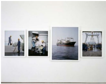
DRAWING RESTRAINT 9: Nisshin Maru , 2005 Four C-prints in self-lubricating plastic frames Panels 1, 2, and 4: 41 1/2 x 33 x 1 1/2 inches each (105.4 x 83.8 x 3.8 cm) Panel 3: 53 x 43 x 1 1/2 inches (134.6 x 109.2 x 3.8 cm) Edition 3 of 3, with 1AP BAR-0002