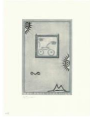
Untitled , 1995 Mezzotint 29 3/4 x 22 1/2 inches (75.6 x 57.2 cm) JOHN-0025