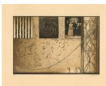
Untitled , 2001 Intaglio 25 7/8 x 33 5/8 inches (65.7 x 85.4 cm) JOHN-0031