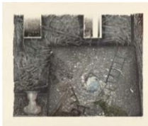
Untitled , 1992 Intaglio 42 1/2 x 52 1/2 inches (108 x 133.4 cm) JOHN-0030