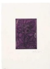
Untitled, 1995 Mezzotint in two colors with chine colle 26 x 19 inches (66 x 48.3 cm) JOHN-0006