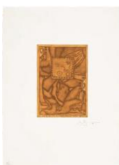
Untitled, 1995 Mezzotint in two colors with chine colle 26 x 19 inches (66 x 48.3 cm) JOHN-0007