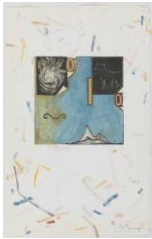
Untitled , 2016 3 plate 4 color lithograph on Fred Siegenthaler confetti paper 19 x 12 inches (48.3 x 30.5 cm) JOHN-0023