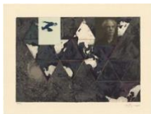
Ocean, 1996 Lithograph in twelve colors 27 7/8 x 36 3/4 inches (70.8 x 93.3 cm) JOHN-0010