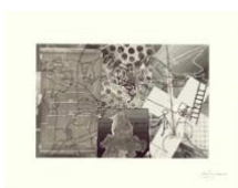
Untitled, 1997 Intaglio in one color 20 x 25 3/4 inches (50.8 x 65.4 cm) JOHN-0008