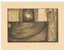
Untitled , 2001 Intaglio 25 7/8 x 33 5/8 inches (65.7 x 85.4 cm) JOHN-0024