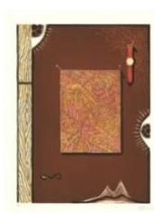
Face with Watch, 1996 Intaglio in five colors 42 x 31 7/8 inches (106.7 x 81 cm) JOHN-0009