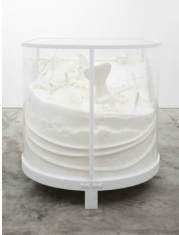
The Cabinet of Nisshin Maru , 2006 Cast polycaprolactone thermoplastic, and self-lubricating plastic in acrylic vitrine 54 1/2 x 54 1/8 x 66 1/2 inches (138.4 x 137.5 x 168.9 cm) BAR-0001