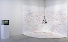
Up to and Including Her Limits , 1975-2008 Crayon on paper, rope, harness, video (color, sound; 29 min.) Dimensions variable SCHN-0001