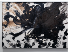
Hiruko , 1992 Oil on canvas 71 1/2 x 102 inches (181.6 x 259.1 cm) SHI-0087