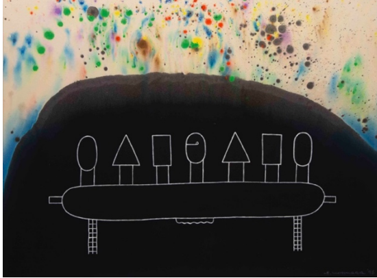
Sadamasa Motonaga, White Linear Shape in Black , 1996

Motonaga died on October 3, 2011, in Kobe, Japan. His work has been the subject of many retrospective exhibitions in Japan, most notably at the Hyogo Prefectural Museum of Art, Kobe, 1998; Hiroshima City Museum of Contemporary Art, 2003; Nagano Prefectural Shinano Art Museum, 2005; and Mie Prefectural Art Museum, Tsu, 2009. Most recently his work is the subject of three solo museum exhibitions in Japan, at the Mie Prefectural Museum of Art (2022); Takarazuka Art Center (2022), Hyogo Prefectural Museum of Art (2022) and Kyu-Suukoudou (old Suukou hall, Iga Ueno, 2022). The first retrospective of his work outside Japan was held at