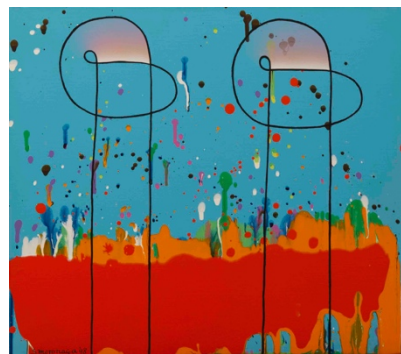
Sadamasa Motonaga, Red Flow, Line, Shape 1998

However, Motonaga’s work remained apolitical and belongs to a special category of transgressive and liberating art which seeks to expand the reach of art to non-specialized audience, via children’s art books, interactive public sculptures, public performances, and art lessons. It is impervious to decoding and beyond words, delighting in the direct pre-verbal communication of rhythmic forms, swirling lines, and flowing shapes.