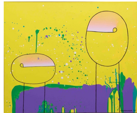
Sadamasa Motonaga, Two Yellows , 1997

Retrospectives of the Gutai Art Association have been held at the National Gallery of Modern Art, Rome, 1990; Jeu de Paume, Paris, 1998; Lugano Cantonal Museum of Art, 2010; National Art Center, Tokyo, 2012; Solomon R. Guggenheim Museum, New York, 2013; and Musée Soulages, Rodez, 2018. The largest ever Gutai survey is currently on view at both the Nakanoshima Museum of Art, Osaka; and the National Museum of Art, Osaka; through January 9th, 2023.