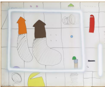
SADAMASA MOTONAGA From Black Lines , 1981 Acrylic on canvas 51 1/8 x 63 3/4 inches (130 x 162 cm) MOT-0141