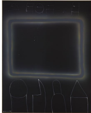
SADAMASA MOTONAGA Big Square of Gray , 1981 Acrylic on canvas 89 3/8 x 71 1/4 inches (227 x 181 cm) MOT-0045