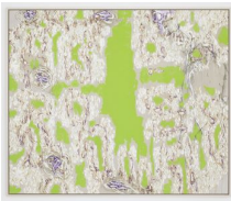
NATSUYUKI NAKANISHI Middle - Swift White XII , 1990 Oil on canvas 74 3/4 x 89 1/2 inches (190 x 227.3 cm) NAK-0131