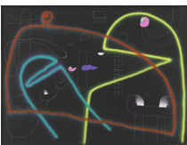
SADAMASA MOTONAGA From Three Color Lines , 1978 Acrylic and oil paint on canvas 38 1/4 x 51 3/8 inches (97 x 130.5 cm) MOT-0143