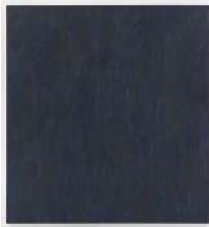
Black Painting: Ultramarine Blue, Burnt Umber I, 1979 Oil on canvas 84 x 78 inches (213.4 x 198.1 cm) HAF-0213