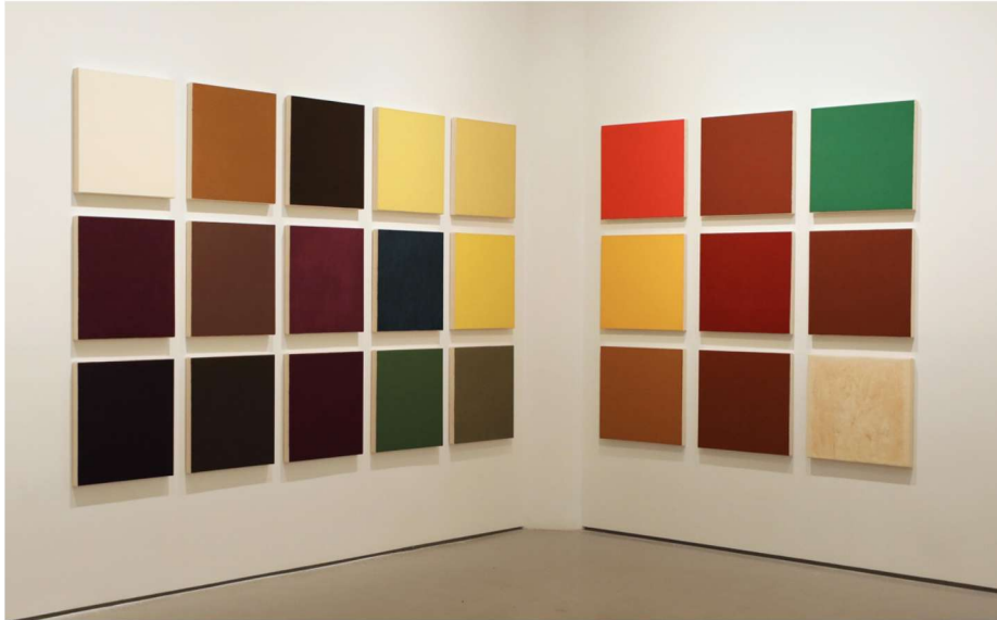
Table of Pigments, 1990-91