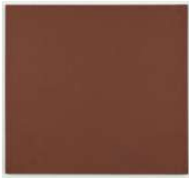
Mass Tone Painting: English Red, March 5, 1974, 1974 Oil on canvas 78 x 84 inches (198.1 x 213.4 cm) HAF-0030