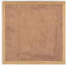
Marble Dust Paintings: Prugna, 1994 Marble dust on pine 17 3/4 x 17 3/4 inches (45.1 x 45.1 cm) HAF-0274