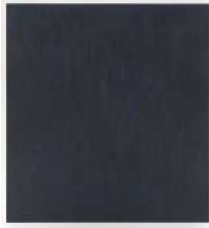
Black Painting: Ultramarine Blue, Burnt Umber IV, 1980 Oil on canvas 84 x 78 inches (213.4 x 198.1 cm) HAF-0215