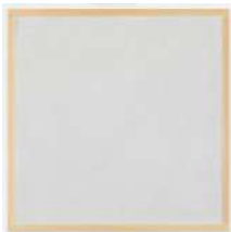
Marble Dust Paintings: Alp Green, 1994 Marble dust on pine 23 1/2 x 23 1/2 inches (59.7 x 59.7 cm) HAF-0277