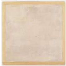
Plaster Study: Thistle Finish, 1994 Plaster on pine 13 x 13 inches (33 x 33 cm) HAF-0282