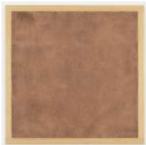
Marble Dust Study: Prugna, 1994 Marble dust on pine 13 x 13 inches (33 x 33 cm) HAF-0279