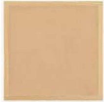
Marble Dust Study: Coral Pink, 1994 Marble dust on pine 13 x 13 inches (33 x 33 cm) HAF-0281