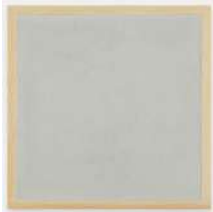
Marble Dust Study: Alp Green, 1994 Marble dust on pine 13 x 13 inches (33 x 33 cm) HAF-0278