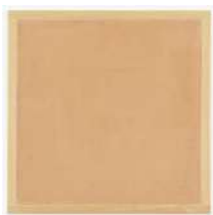
Marble Dust Study: San Ambrogio, 1994 Marble dust on pine 13 x 13 inches (33 x 33 cm) HAF-0280