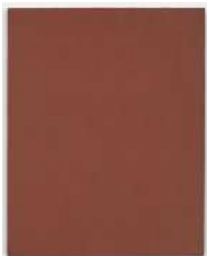
Mass Tone Painting: English Red, Spring 1973, 1973 Oil on canvas 28 x 22 inches (71.1 x 55.9 cm) HAF-0025