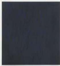
Black Painting: Ultramarine Blue, Burnt Umber VII, 1980 Oil on canvas 84 x 78 inches (213.4 x 198.1 cm) HAF-0216