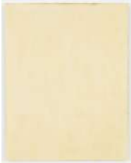
Mass Tone Painting: White Lead, July 1973, 1973 Oil on canvas 28 x 22 inches (71.1 x 55.9 cm) HAF-0023