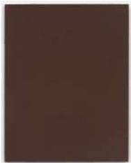
Mass Tone Painting: Burnt Sienna, Spring 1973, 1973 Oil on canvas 28 x 22 inches (71.1 x 55.9 cm) HAF-0024