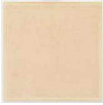
Marble Dust Paintings: San Ambrogio, 1994 Marble dust on pine 23 1/2 x 23 1/2 inches (59.7 x 59.7 cm) HAF-0276