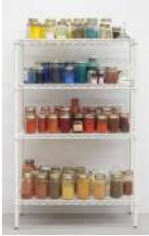
Studio Pigments and Shelf 60 x 35 1/2 x 14 inches (152.4 x 90.2 x 35.6 cm) HAF-0286