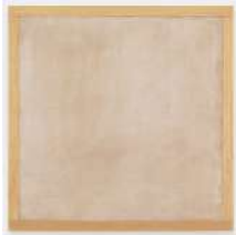
Plaster Study: Thistle Finish with Marble Dust, 1994 Plaster on pine 13 x 13 inches (33 x 33 cm) HAF-0284