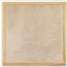
Plaster Study: Thistle Multi Finish, 1994 Plaster on pine 13 x 13 inches (33 x 33 cm) HAF-0283